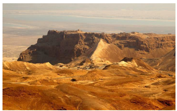
Masada - Siege Ramp

Visit Tel Arad and the ancient temple sites on the edge of the Syro-African rift. The north-south stretch of land from the tip of the Dead Sea to the Red Sea is almost 100 miles. Although not a desirable route for ancient caravans, the nomadic Bedouins found subsistence. Ride camels into the Arabah sands. The journey into Makhtesh Ramon is a window of explanations about the Bedouin ways , desert, and the famous spice route. The complimentary lunch will be in a traditional Bedouin tent, and includes traditional Bedouin service and stories . Some Bible scholars note that until one visits the wilderness the land of the Bible has not been visited, since 70% of Bible narratives involve the wilderness. Return to the Dead Sea. BLR Tracker: p. 8, #20 - ARABAH